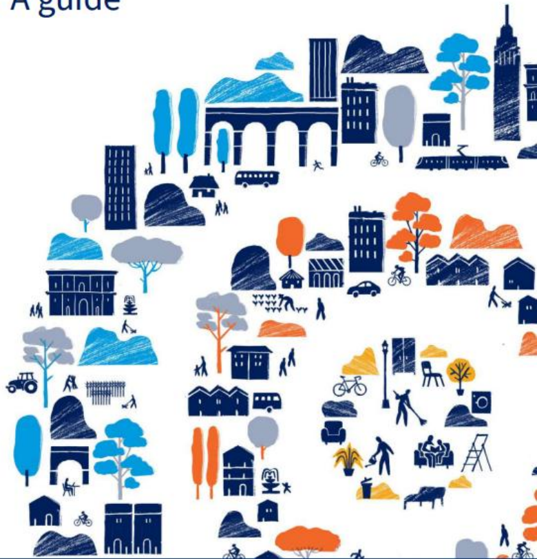
Fig. 11. Visual representation of the Age Friendly Ireland web of relations

National programmes for age-friendly cities and communities A guide